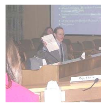
Salem, OR. April 2007. Testifying to the Oregon State Legislature's Health Policy Committee.